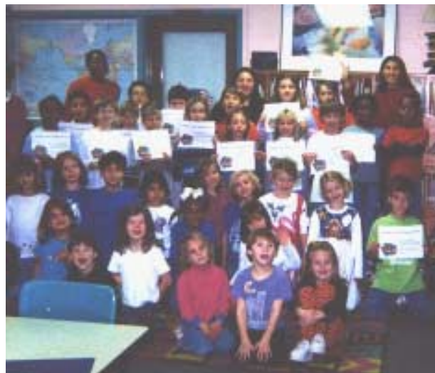
Students at Percy Priest Elementary School graduate from their fall semester Spanish class