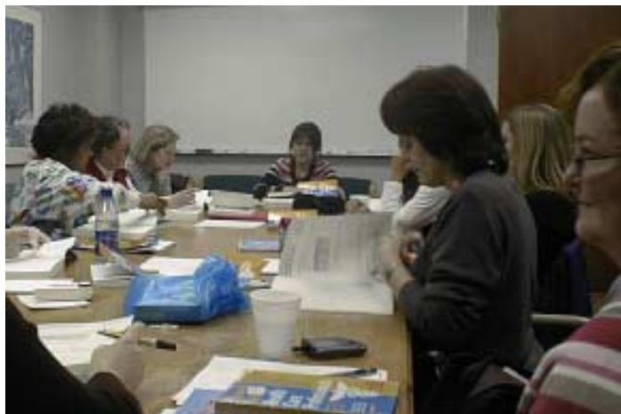
Vanderbilt students prepping for a quiz

This increasing need for language training prompts more and more medical community members to look to TFLI for assistance.